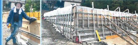
Parking Lot to be - raising the wall