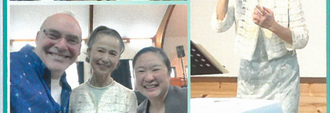
2 Concerts - Rengo Womens Conference and Daito Church in Osaka