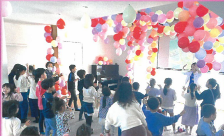
Kids Summer Saturday VBS