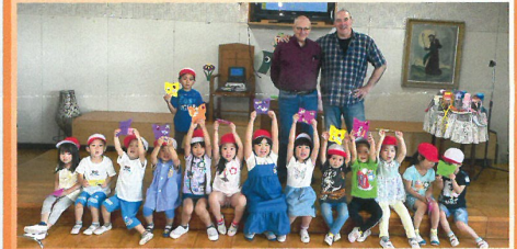
Thursday English and Costco Donation