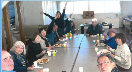
Lunch and Fellowship