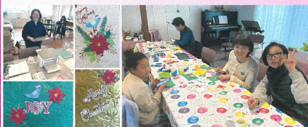
Making Christmas Cards