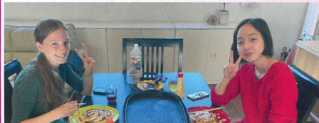
Youth Time and Card making