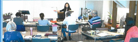
Wednesday Bible Study