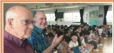
Monday Chapel Time at Grace Preschool