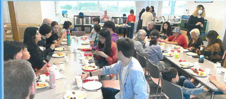
When everyone brings somebody