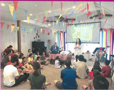
Kids Easter Saturday VBS