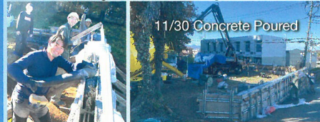
11/30 Concrete Poured