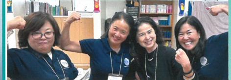
Community Bible Study Seminar Translating